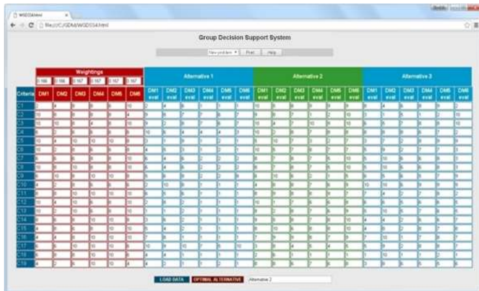
Fig. 5. The screen with WDM and determined group alternative

Involving multiple DMs contribute to preventing prejudice and reducing siding in the decision making process. The degrees of importance of all DMs are determined according to special characteristics of each DM such as: specialization, experience, knowledge, shown to the moment abilities, etc. The final decision is taken by high level executive management by taking into account the determined best alternative as result of using of such mathematically reasoned BI-GDSS.