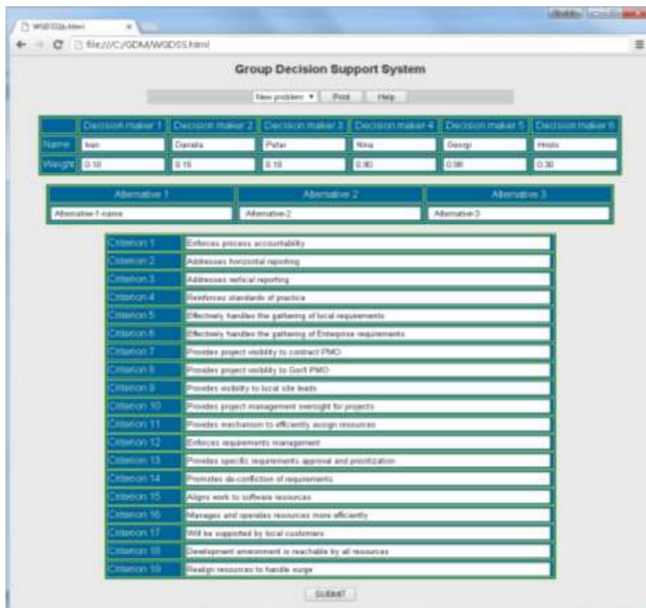
Fig. 3. Administrative screen for entering of DMs, weights, alternatives and evaluation criteria

The input data of particular GDM problem include: name of the problem, number of DMs, number of alternatives and evaluation criteria. When these parameters are known the WDM can be generated. The names and weight of DMs is entered together with description of evaluation criteria and alternatives on next screen as shown in Fig. 3.